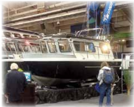
exhibitors of boating accessories, fishing and hunting destinations and fishing products.

As many of you may know the Seattle Boat Show is the largest of its kind on the West Coast. The number of boat manufacturers there is enormous, and there are over 1,000 boats on display at the CenturyLink Convention Center and even more that you can see via regular shuttle service to Lake Union. Here the really big boats, some over 100 feet are displayed on the water. In addition to the boats there are incredible numbers of